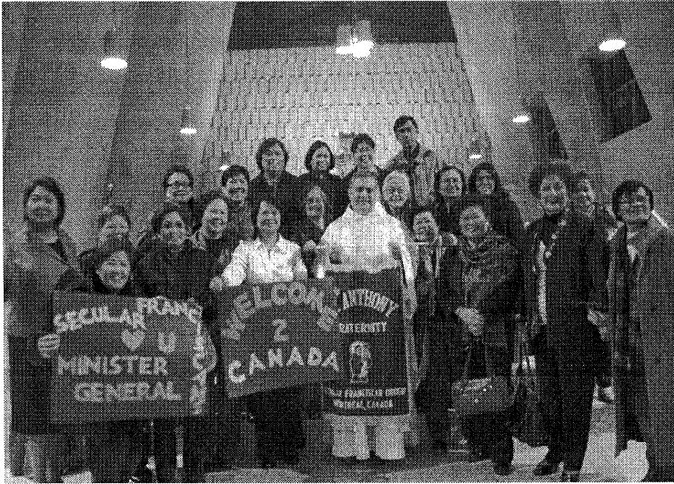
St. Anthony Fraternity members with the Minister General holding the banner and appreciating our fraternity's warm welcome